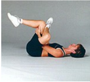
Fig.4 Knee to Chest

1 2 3 4 5 6 7 8 9 10 11 12 13 14 15 16 17 18 19 20 21 22 23 24 25 26 27 28 29 30 31